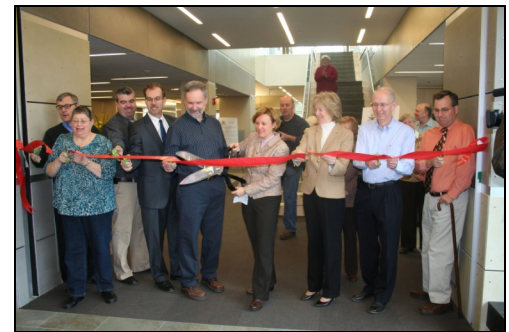
Grand Opening - Ribbon Cutting of the new Library Building, February 28, 2012