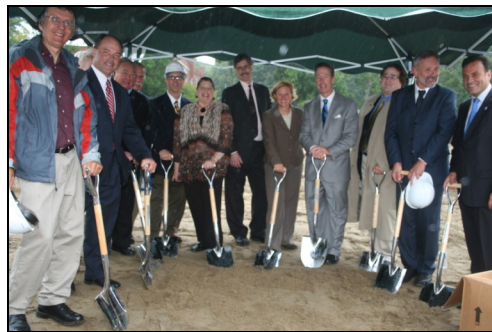
Groundbreaking of the new Library Building, August 28, 2010

The 5th anniversary celebration is sponsored by the Walpole Public Library Trustees with the support of the Library Friends and the Library staff.